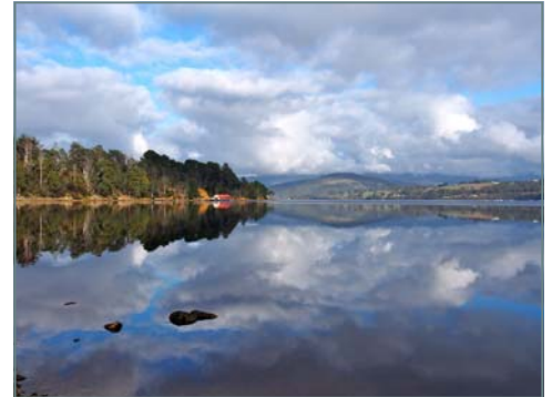
Huon River, Glaziers Bay

LOVETT GALLERY welcomes back one of our favourite exponents of photography - BOB BROWN . His new exhibition at the Lovett Gallery opens on September 20 . The photograph at right gives a preview of what we may look forward to.