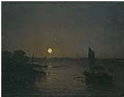
Moonlight study at Millbank (exh. 1797)