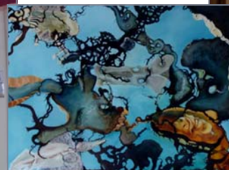
Oil/Acrylic High Commended Julie Winlow - "Resting Place"