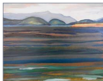
Student Highly Commended Award - Willow Ingram "Winter/Summer at Sandrock"