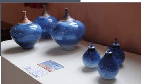
Highly Commended 3D - Ian Clare "A Drop in the Ocean"